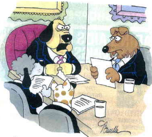
"Gentlemen, I've just seen the quarterly reports, and believe me, I am not wagging my tail."