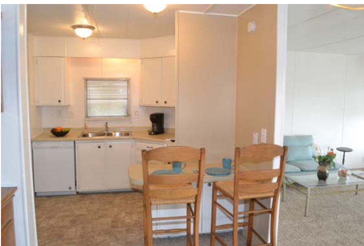
Breakfast serving counter between kitchen and dining areas