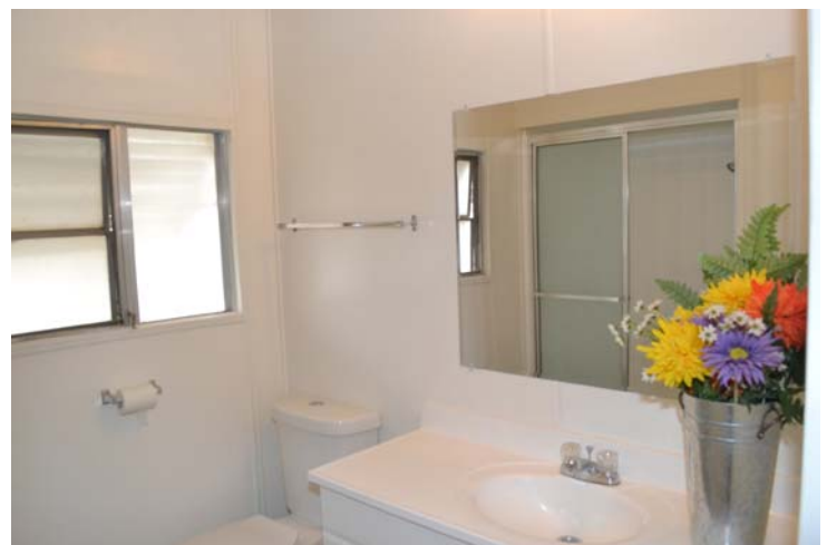
Master bathroom with walk-in shower