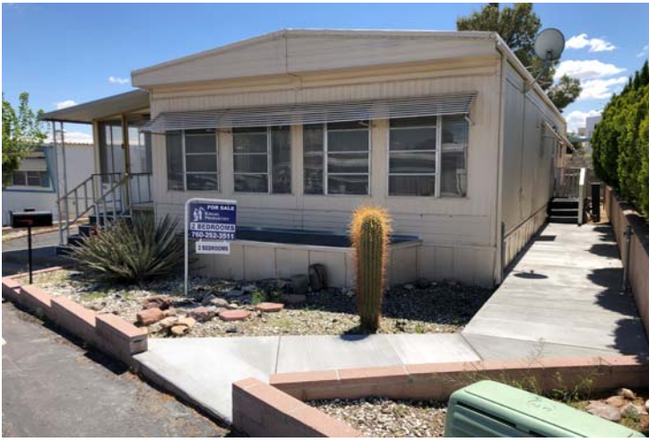
Walkway to Back Door