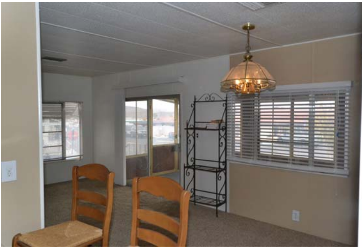
Spacious enclosed dining area, adjacent to sun porch