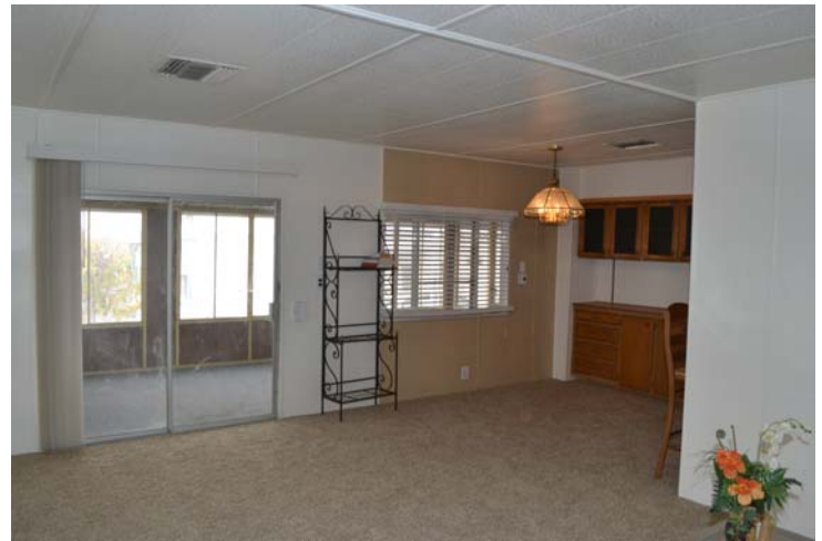
Built-in hutch in dining room